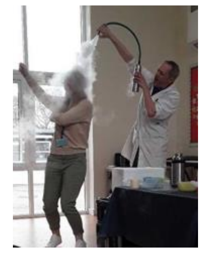
Dry Ice Assembly!