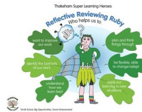
Harley (Oak) Freddie (Oak)