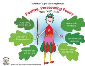
Jasper (Acorn) Dylan (Oak)